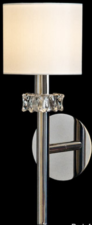
Park Avenue S15