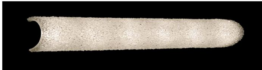
S36 with Clear Frizzanté Glass Diffuser

** Please contact your local Representative for pricing, availability, and product modifications.**