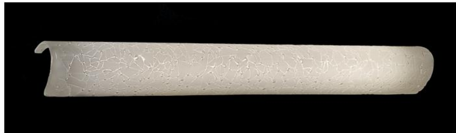
S36 with White Glass Mosaic Diffuser